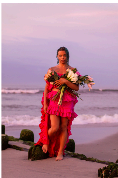
Title: Tourmaline on the Beach

Explanation: Image description provided by person pictured.